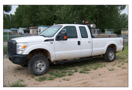
2013 - Ford F350 with service body