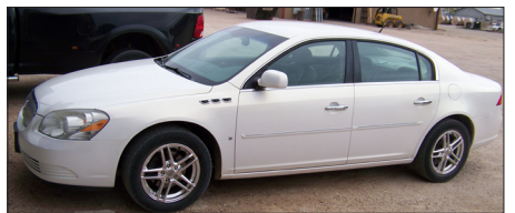
2007 - Buick Lucerne