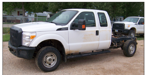
2014 - Ford F250 pickup cab & chassis, 56" CA

Regular business: 1-800-442-3630 Report an outage: 1-888-391-6220