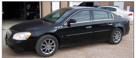
2007 - Buick Lucerne