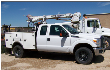
2013 - Ford F350 with service body