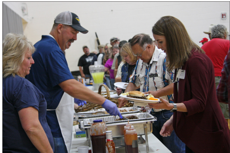
Lunch, served by the Invasion Bar of Kaycee, fed more than 300 PRECorp members and guests who attended the Annual Meeting.