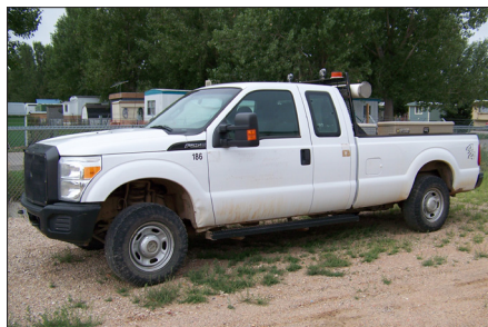
2012 - Ford F250 full size box