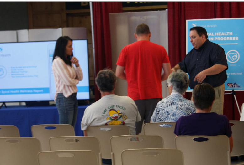
PRECorp members take advantage of the wellness blood draw and body scanners at the Annual Meeting.