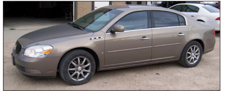
2006 - Buick Lucerne