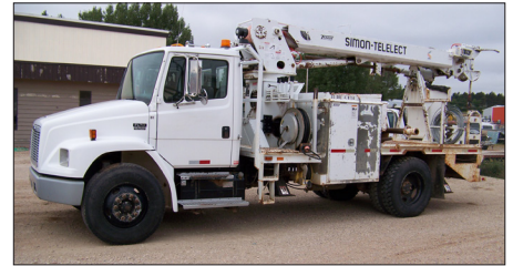
2001 Freightliner-1995 Digger

Once the auction ends, eBay will send out a notification to the winning buyer and PRECorp. At that point, PRECorp will e-mail the buyer with information on how to make contact, payment, and where to pick up the unit.