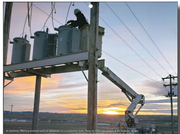
At daybreak, PRECorp Linemen work on equipment on a transformer bank.