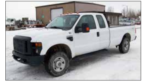
2009 Ford F250 extended cab with long box