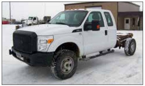
2011 Ford F350 cab and chassis

Prior to the opening of the sale on May 18, please obtain more information via e-mail at fleet@precorp.coop. This is the only source of information on these items prior to the