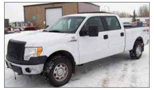
2010 Ford F150 crew cab with short box