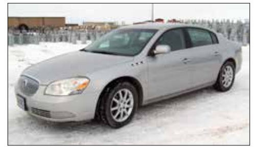
2008 Buick Lucerne