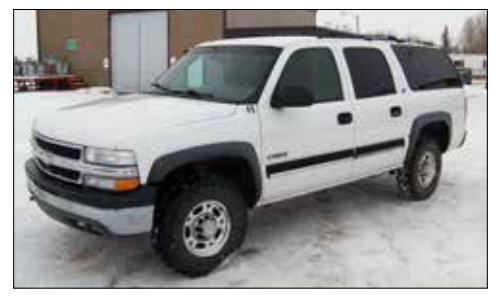
2001 Chevy Suburban

Regular business: 1-800-442-3630 • Report an outage: 1-888-391-6220 www.precorp.coop Powder River Energy Corporation is an equal opportunity provider and employer.