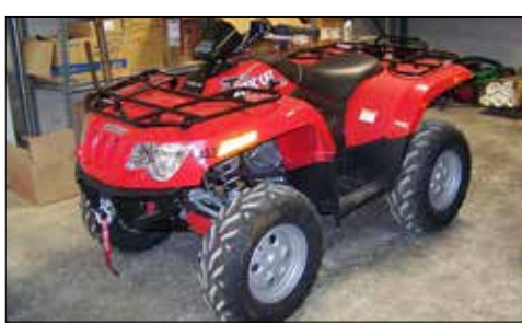
2010 550 Arctic Cat Four Wheeler (4 offered)