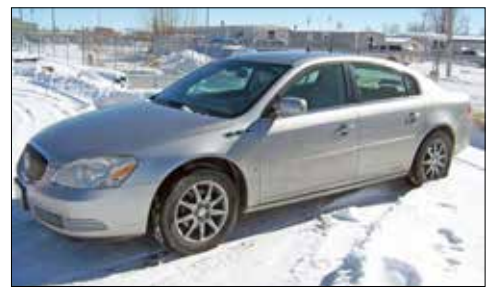
2006 Buick Lucerne