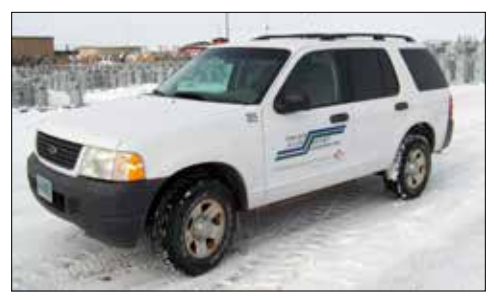
2003 Ford Explorer