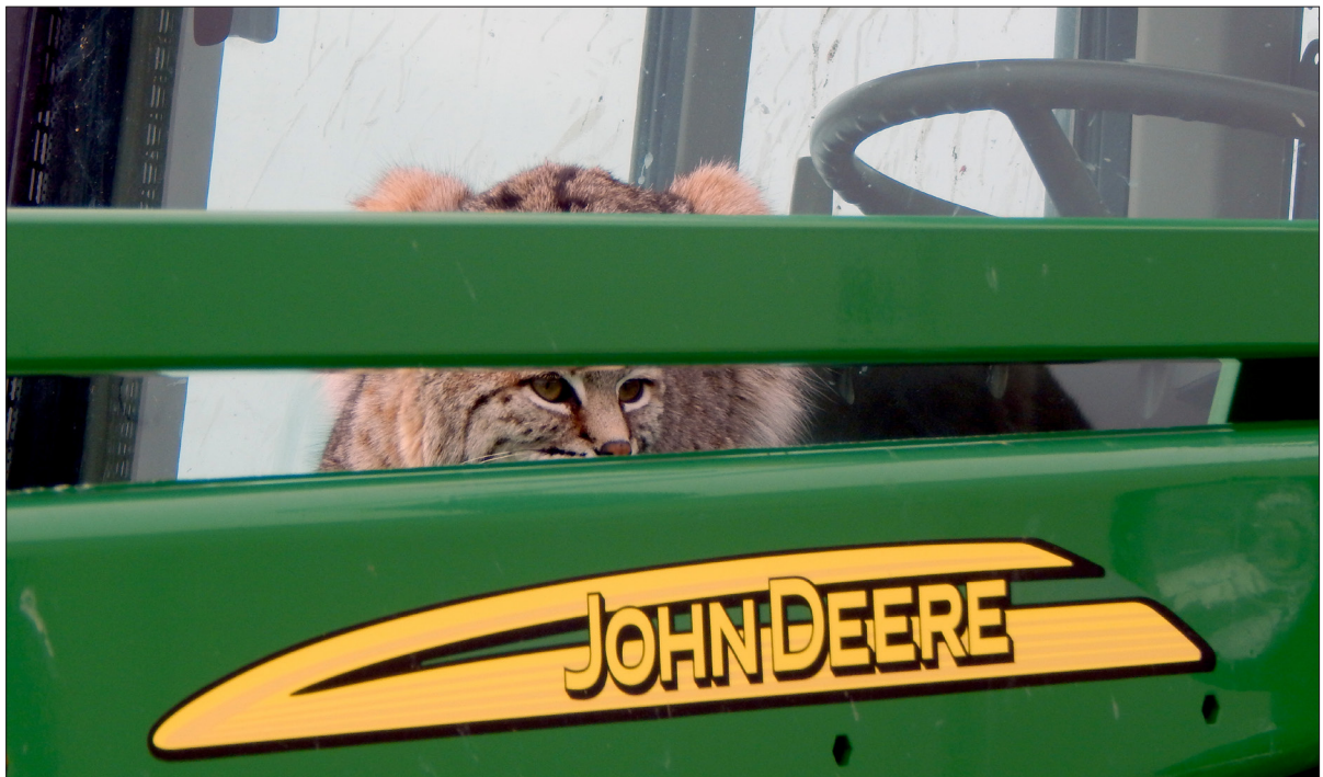
A bobcat and a Deere near Wright, WY.