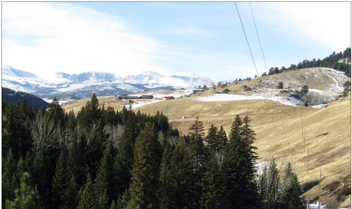
The Mountain Power Line near Buffalo in Johnson County.