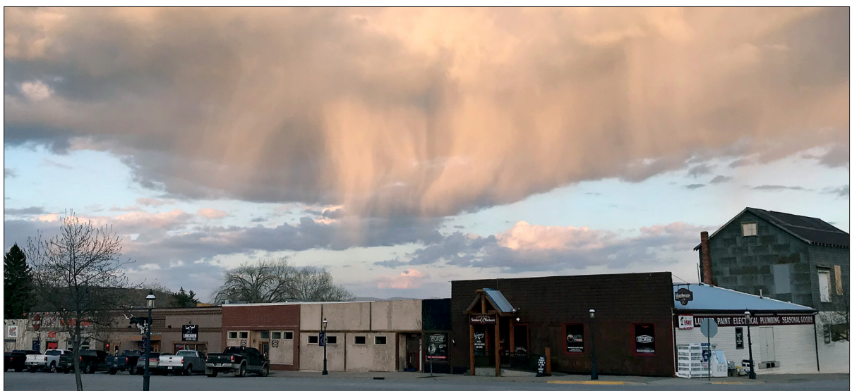
Main Street in Sundance, WY.

Monday and Tuesday, June 17-18, in Sheridan.