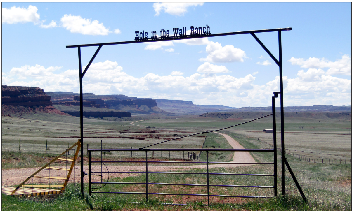
Entrance to a ranch in Johnson County.

9:30 a.m., Tuesday, April 16, in Sundance.