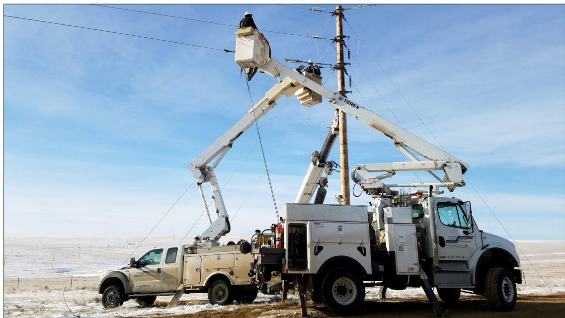
The PRECorp Line Crew from Wright works on an overhead power line.

9:30 a.m., Tuesday, February 19, in Gillette.