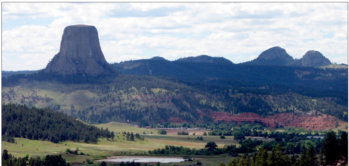
The scenic Belle Fourche River valley in Crook County.