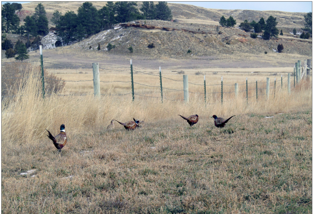
Pheasants on patrol in Sheridan County.

Upcoming meeting: Tuesday, November 19, in Gillette.