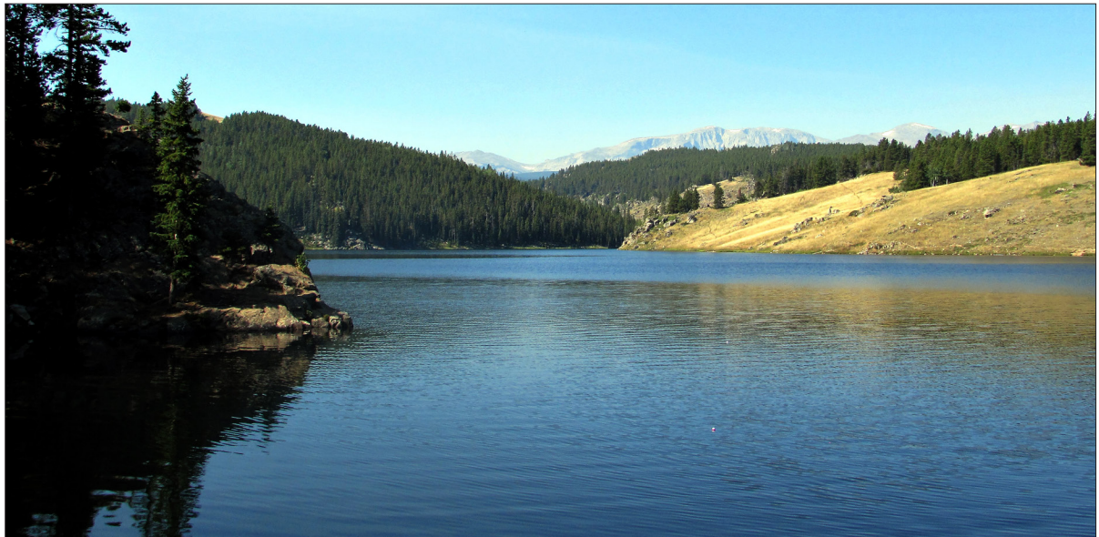
Tie Hack Reservoir in Johnson County.

9:30 a.m., Tuesday, May 21, in Gillette.