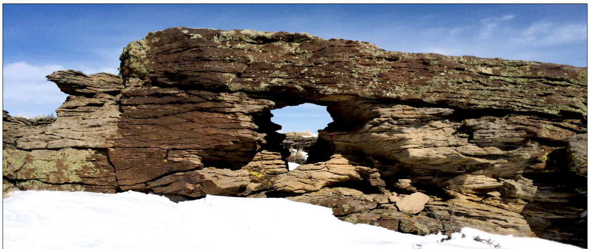
Snow on the rocks at Pumpkin Buttes in Campbell County.

9:30 a.m., Monday and Tuesday, March 18-19, in Sheridan.