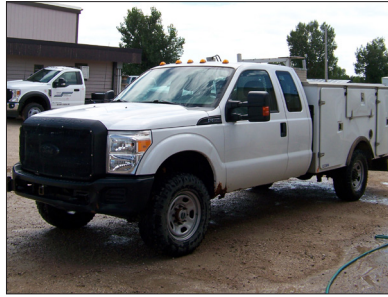
Unit 4008: 2013 Ford F-350 Superduty; 6.2L V8 gasoline engine; 4x4 automatic, super cab; 144,963 miles

Once the auction ends, eBay will send out a notification to the winning buyer and PRECorp. At that point, PRECorp will e-mail the buyer with information on how to make contact, payment, and where to pick up the unit.