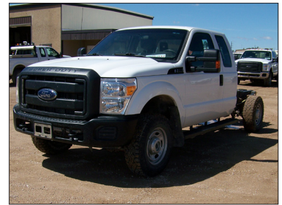
Unit 4034: 2015 Ford F-250; 6.2L V8 gasoline engine; 4x4 automatic, extended cab; 208,918 miles