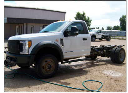
Unit 4017: 2017 Ford F-550; 6.7L V8 diesel engine; 4x4 automatic, single cab; 112,119 miles