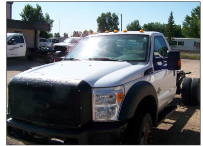
Unit 4056: 2015 Ford F-550; 6.7L V8 diesel engine; 4x4 automatic, single cab; 162,576 miles