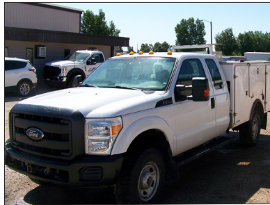
Unit 4047: 2015 Ford F-350 Superduty; 6.2L V8 gasoline engine; 4x4 automatic, super cab; 130,461 miles