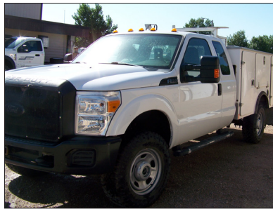
Unit 4021: 2014 Ford F-350 Superduty; 6.2L V8 gasoline engine; 4x4 automatic, super cab; 127,748 miles