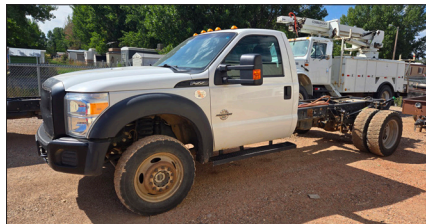
2017 Ford F550 4x4 Chassis 94,253 miles 6.7 Diesel with an Automatic Transmission.

Beginning at 8 p.m. October 11, one unit will be listed every 15 minutes until all units are listed. This will allow for one closing every 15 minutes beginning at 8 p.m. on October 21, 2024, in the event an