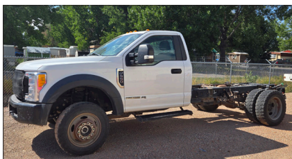
2017 Ford F550 4x4 Chassis 130,294 miles 6.7 Diesel with an Automatic Transmission.

These vehicles were used for field service work. They have been regularly serviced and records are