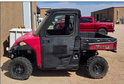
2015 Polaris Ranger 900 4x4 needs driveline repair.

available. The trucks were actively working in the field until the day they were retired from the fleet. All decals will be removed prior to sale, and trucks will be cleaned.