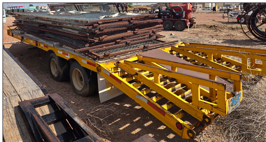
1992 czeng 25' tandem trailer with fold down ramps 24 GVWR, Will need tires and repairs. Panels pictured are not included.

individual is bidding on more than one unit.