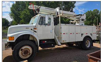
2001 international 4800 series 4x4 dt466 Manual trans, Boom is inoperable. Would be a great service body unit.