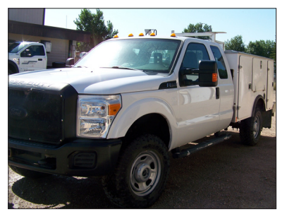
Unit 4021: 2014 Ford F-350 Superduty; 6.2L V8 gasoline engine; 4x4 automatic, super cab; 127,748 miles