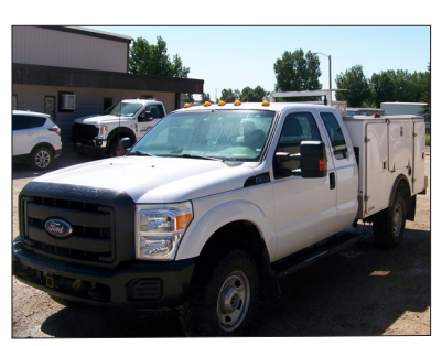
Unit 4047: 2015 Ford F-350 Superduty; 6.2L V8 gasoline engine; 4x4 automatic, super cab; 130,461 miles