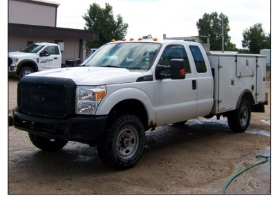
Unit 4008: 2013 Ford F-350 Superduty; 6.2L V8 gasoline engine; 4x4 automatic, super cab; 144,963 miles

Once the auction ends, eBay will send out a notification to the winning buyer and PRECorp. At that point, PRECorp will e-mail the buyer with information on how to make contact, payment, and where to pick up the unit.