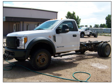
Unit 4017: 2017 Ford F-550; 6.7L V8 diesel engine; 4x4 automatic, single cab; 112,119 miles