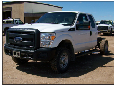
Unit 4034: 2015 Ford F-250; 6.2L V8 gasoline engine; 4x4 automatic, extended cab; 208,918 miles