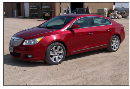
2012 Buick Lacrosse