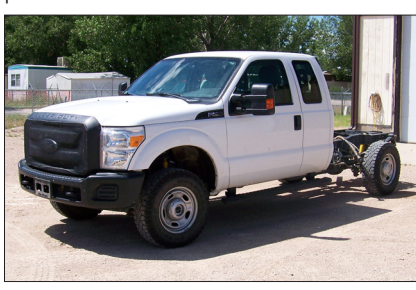
2014 Ford F250 cab and Chassis 56"CA