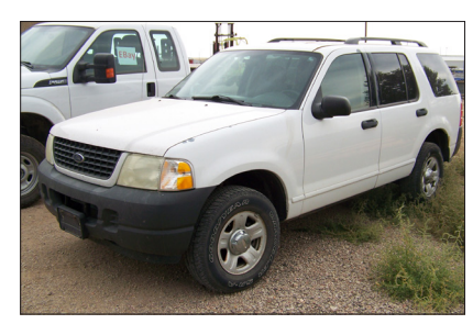
2003 Ford Explorer