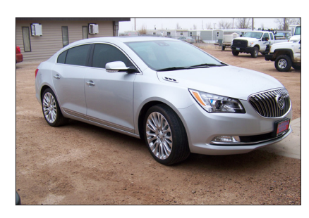
2014 Buick Lacrosse