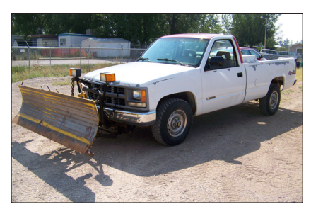
1994 Chevy half ton with snow plow

Once the auction ends, eBay will send out a notification to the winning buyer and PRECorp. At that point, PRECorp will e-mail the buyer with information on how to make contact, payment, and where to pick up the unit.