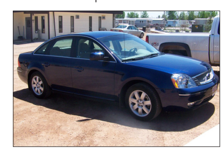
2007 Ford Five Hundred