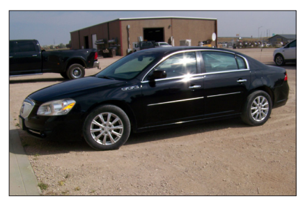
2011 Buick Lucerne