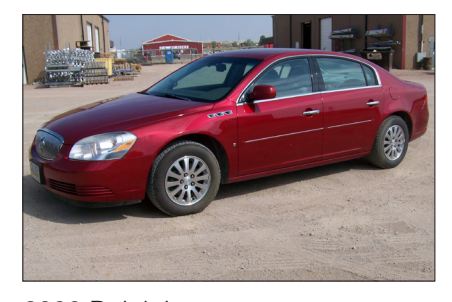
2008 Buick Lucerne