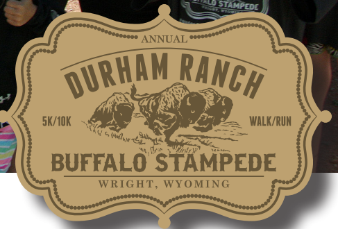
Runners at the 2018 Buffalo Stampede salute the camera after the event.