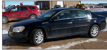
2008 - Buick Lucerne