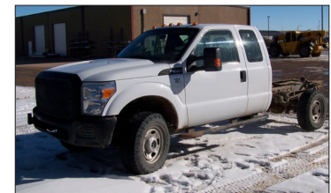
2011 - Ford F350 cab and chassis 60-inch CA