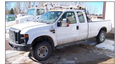
2009 - Ford F250 pickup