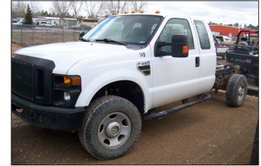
2008 - Ford F350 cab and chassis 60-inch CA