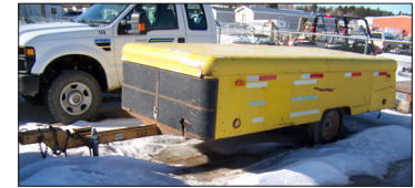
1958 Kearney box trailer