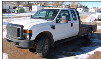
2008 - Ford F350 with flatbed