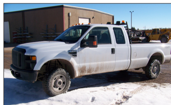
2009 - Ford F350 pickup