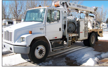
2001 - Freightliner chassis with a 1995 Terex digger derrick

Once the auction ends, eBay will send out a notification to the winning buyer and PRECorp. At that point, PRECorp will e-mail the buyer with information on how to make contact, payment, and where to pick up the unit.