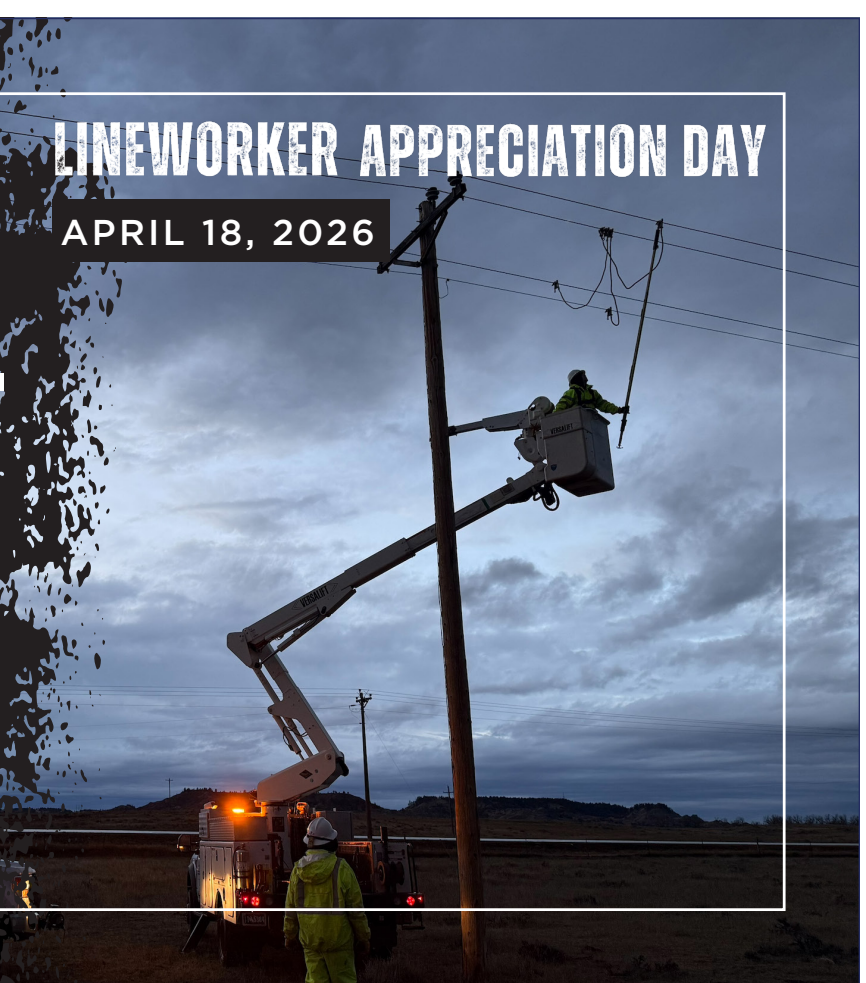
PHOTO: PRECorp linemen restore power after a 2026 wind storm in Campbell County.

We thank the entire PRECorp System Operations team for their commitment to powering our local communities.