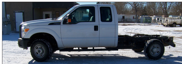
Unit 4034: 2015 Ford F-250 Superduty; 6.2L V8 gasoline engine; 4x4 automatic, extended cab, cab and chassis only