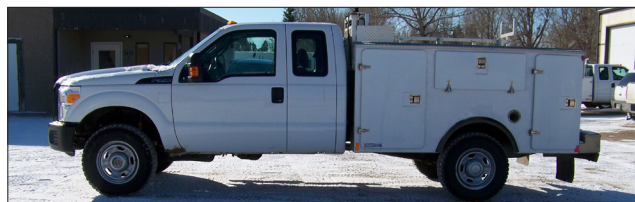
Unit 4024: 2014 Ford F-350 Superduty; 6.2L V8 gasoline engine; 4x4 automatic, extended cab

Once the auction ends, eBay will send out a notification to the winning buyer and PRECorp. At that point, PRECorp will e-mail the buyer with information on how to make contact, payment, and where to pick up the unit.