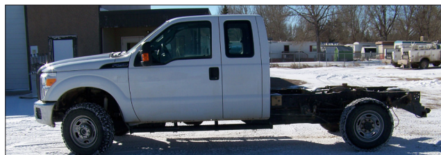
Unit 4064: 2015 Ford F-250 Superduty; 6.2L V8 gasoline engine; 4x4 automatic, extended cab, cab and chassis only