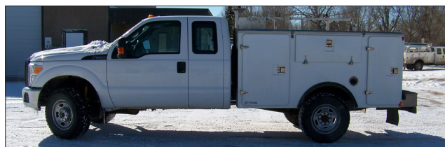
Unit 4071: 2016 Ford F-350 SuperdutyXL; 6.2L V8 gasoline engine; 4x4 automatic, extended cab