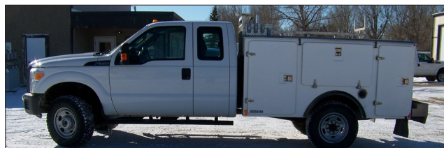
Unit 4046: 2014 Ford F-350 Superduty; 6.2L V8 gasoline engine; 4x4 automatic, extended cab