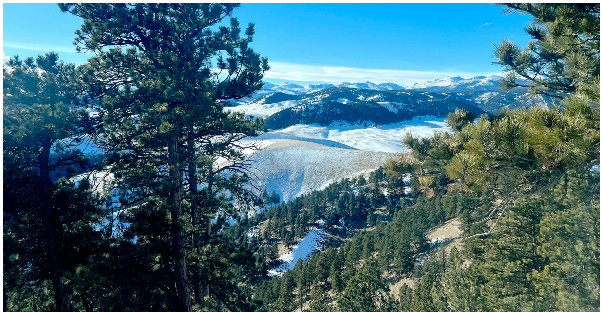
Winter view from Warren Peak in Crook County.