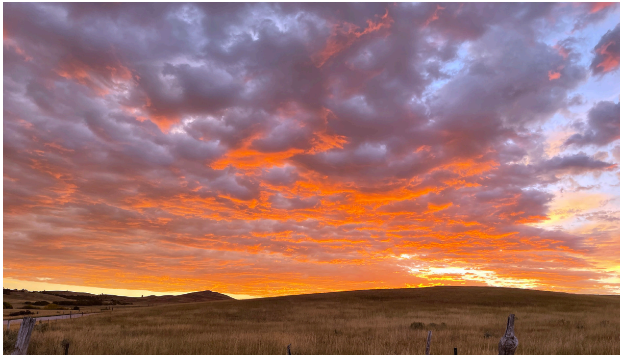
A golden sunset in Crook County.