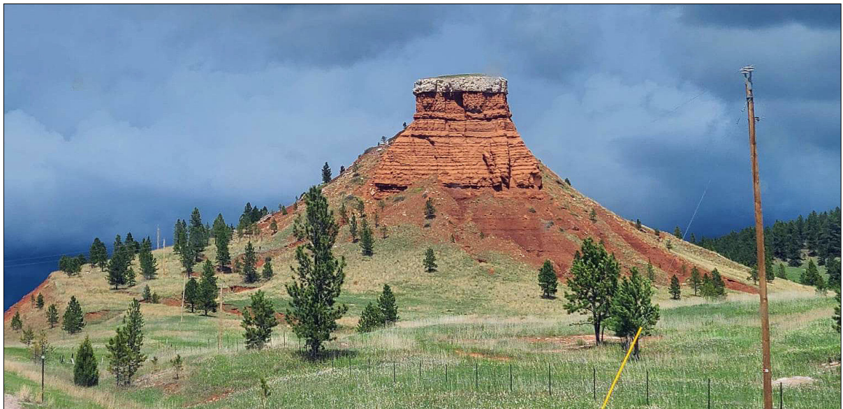
Red Butte in storm along Highway 85 in Weston County.