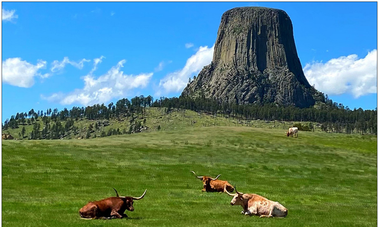
Longhorns rest in a pasture near Devils Tower