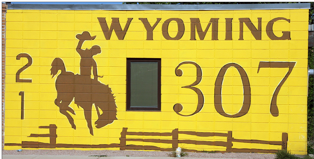
Building mural in Upton, Wyoming.