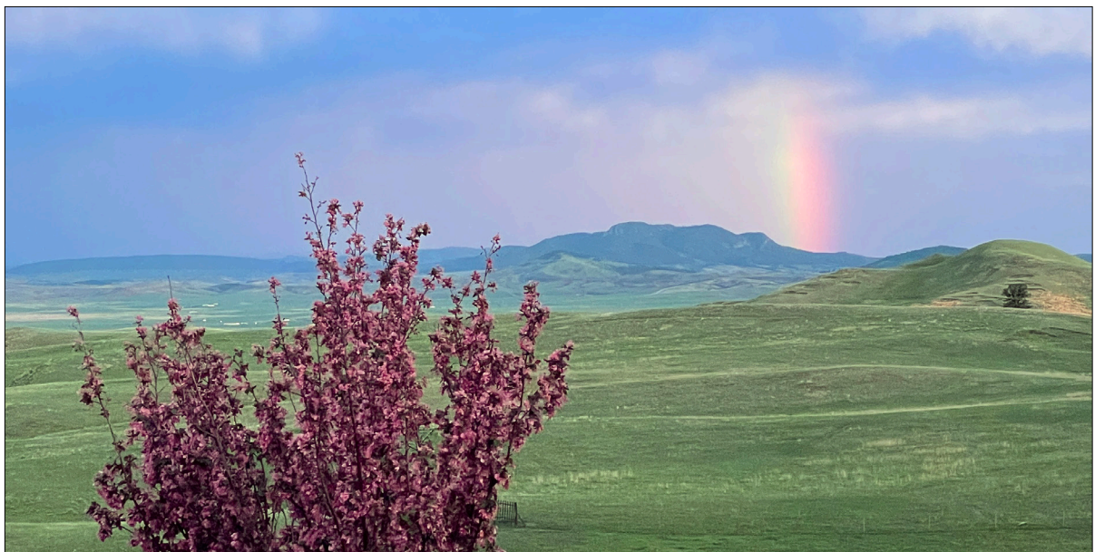
A short rainbow over Inyan Kara in Crook and Weston counties.