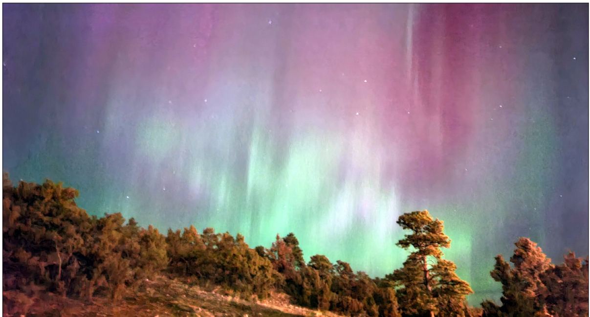
Northern lights on display over Sundance.