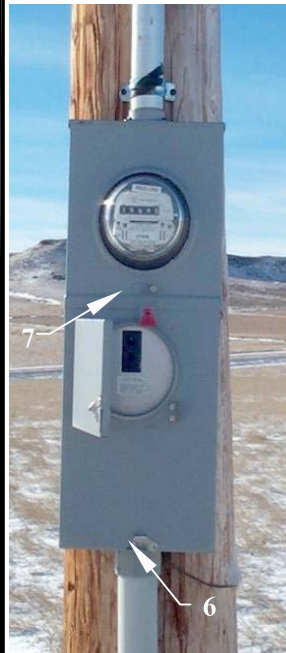
Ground per RUS standard H1.1