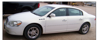
2007 - Buick Lucerne