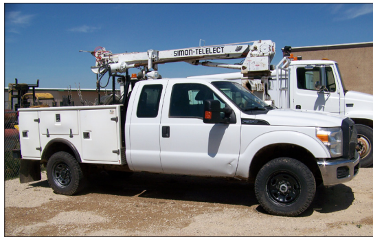
2013 - Ford F350 with service body