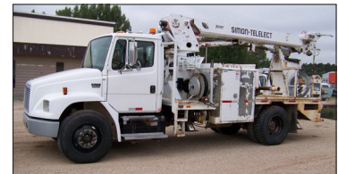
2001 Freightliner-1995 Digger

Once the auction ends, eBay will send out a notification to the winning buyer and PRECorp. At that point, PRECorp will e-mail the buyer with information on how to make contact, payment, and where to pick up the unit.