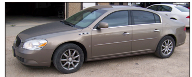
2006 - Buick Lucerne