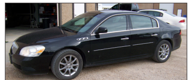
2007 - Buick Lucerne