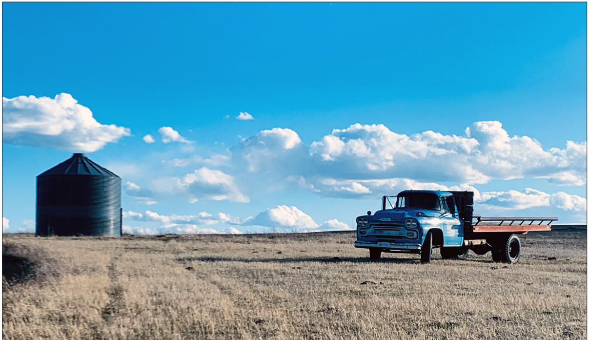
Old truck in the pasture waiting for Spring.