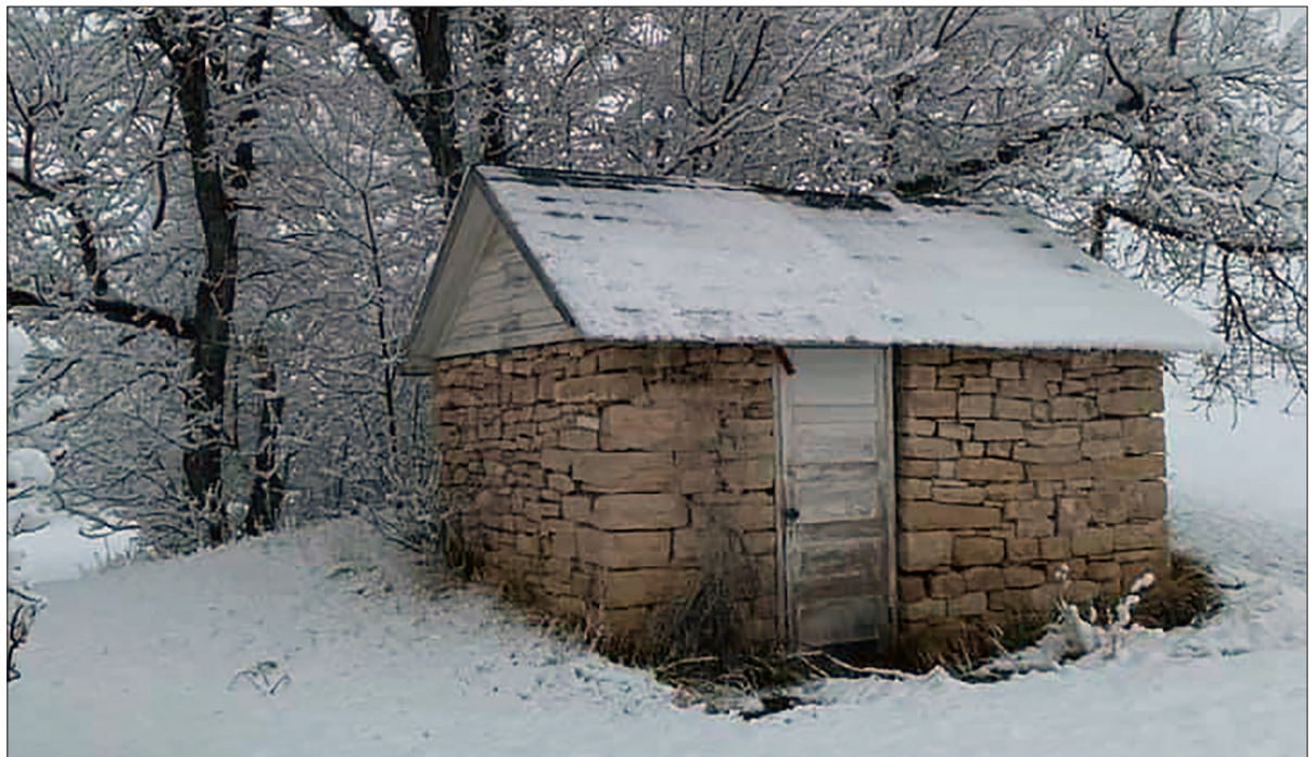
Frosty stone house in Crook County.

Tuesday, February 22, 2022, in Gillette.