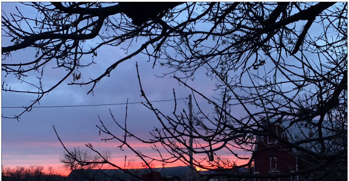
Sunset on the farm.

Tuesday, November 15, 2022, in Gillette.