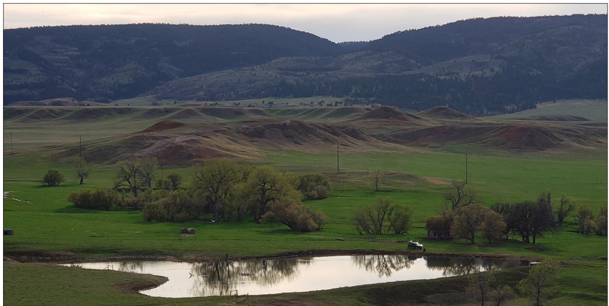
The pastures are greening up in northeast Wyoming.