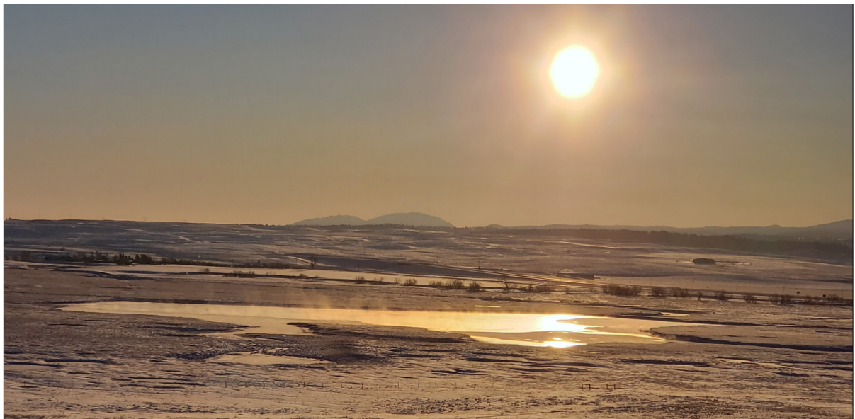
Winter solstice in Crook County