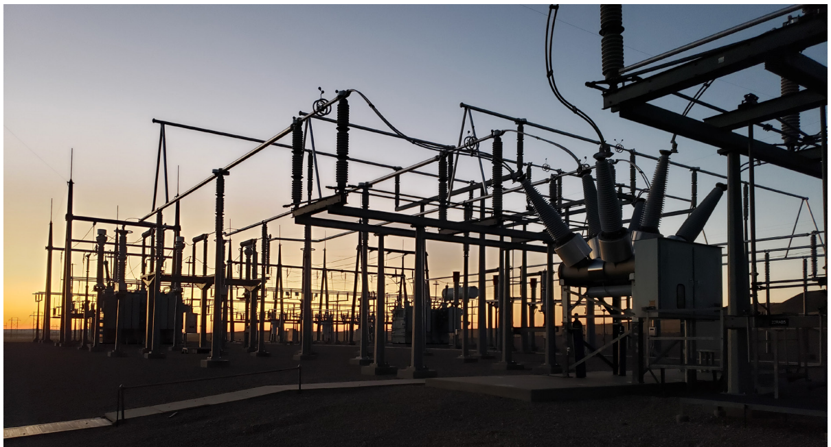
Substation at sunrise.

Tuesday, September 20, 2022, in Sheridan.