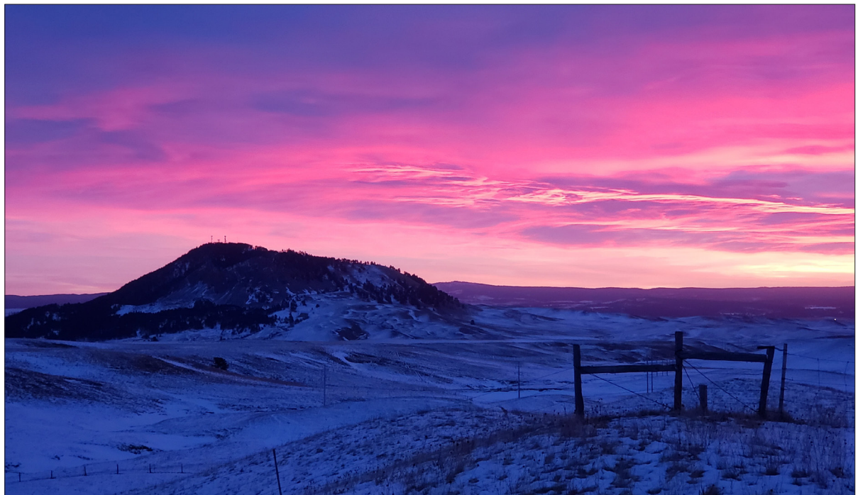
Morning sunrise at Sundance Mountain.